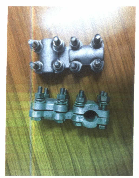
1 Ttype P. G. Clamps (Heavy Duty)